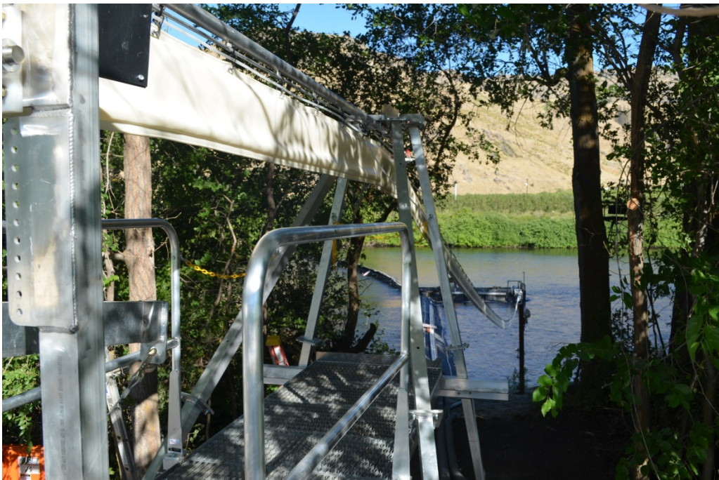
Figure 1. The configuration of the Whooshh™ tube system and the Okanogan weir trap. The tube is connected to the east, upstream side of the trap box and a stationary trailer on the east shore. Adult fish that are transported through the tube are directed into a 300 gallon tanker truck.