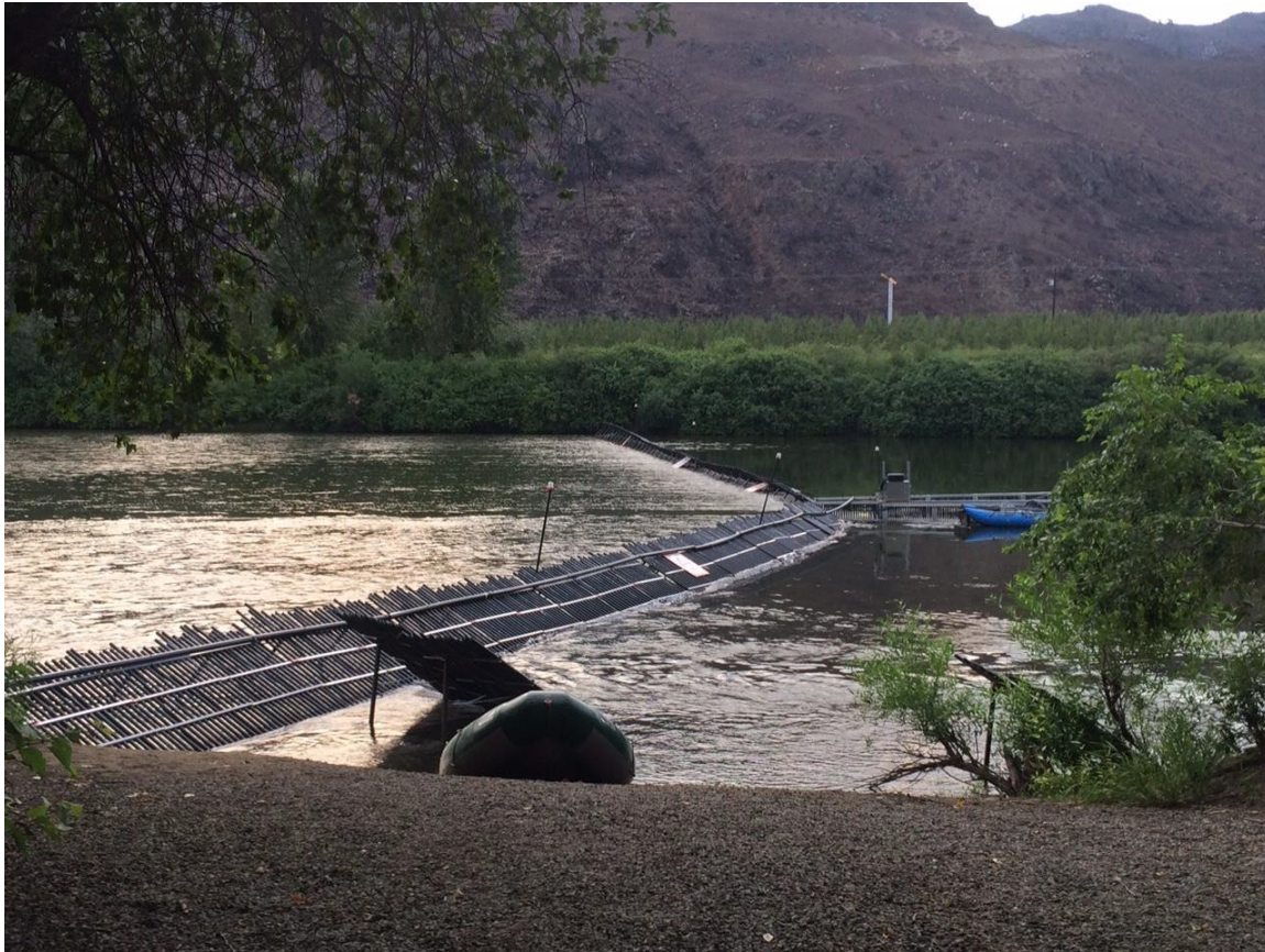
Figure 2. The deployed weir in 2014. The water deflecting panels are visible in the foreground.

A sediment plume during deployment has not been observed in past years. Nevertheless, turbidity shall not exceed 5 NTU's above background levels at 200 feet downstream of the project location. If the differential exceeds the allowable range, the particular construction activity that is responsible for introducing turbidity will be terminated until mitigating measures can be developed and implemented. A daily log of turbidity measurements will be updated and maintained on site (Datasheet #9)