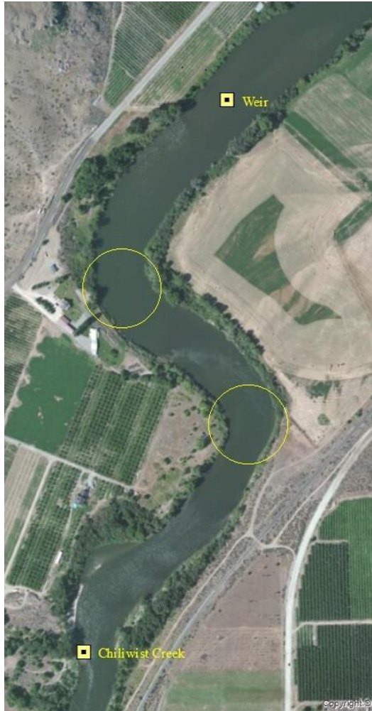
Figure 4. Map of the Okanogan River 1 km. below the weir. Observations from the bank will be directed in and around the two circled areas.